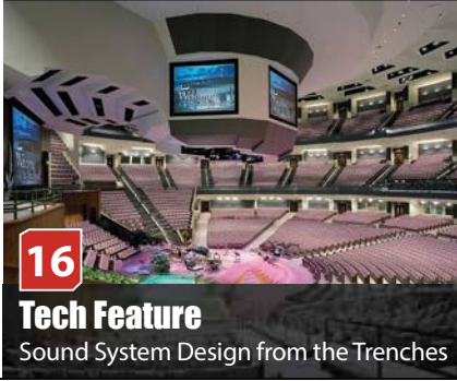
16 Tech Feature Sound System Design from the Trenches