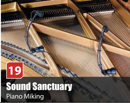
19 Sound Sanctuary Piano Miking