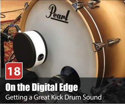
18 On the Digital Edge Getting a Great Kick Drum Sound